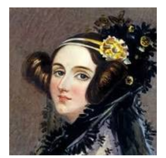
"Ada King, Countess of Lovelace" by Alfred Edward Chalon, 1840. This image is in the public domain.