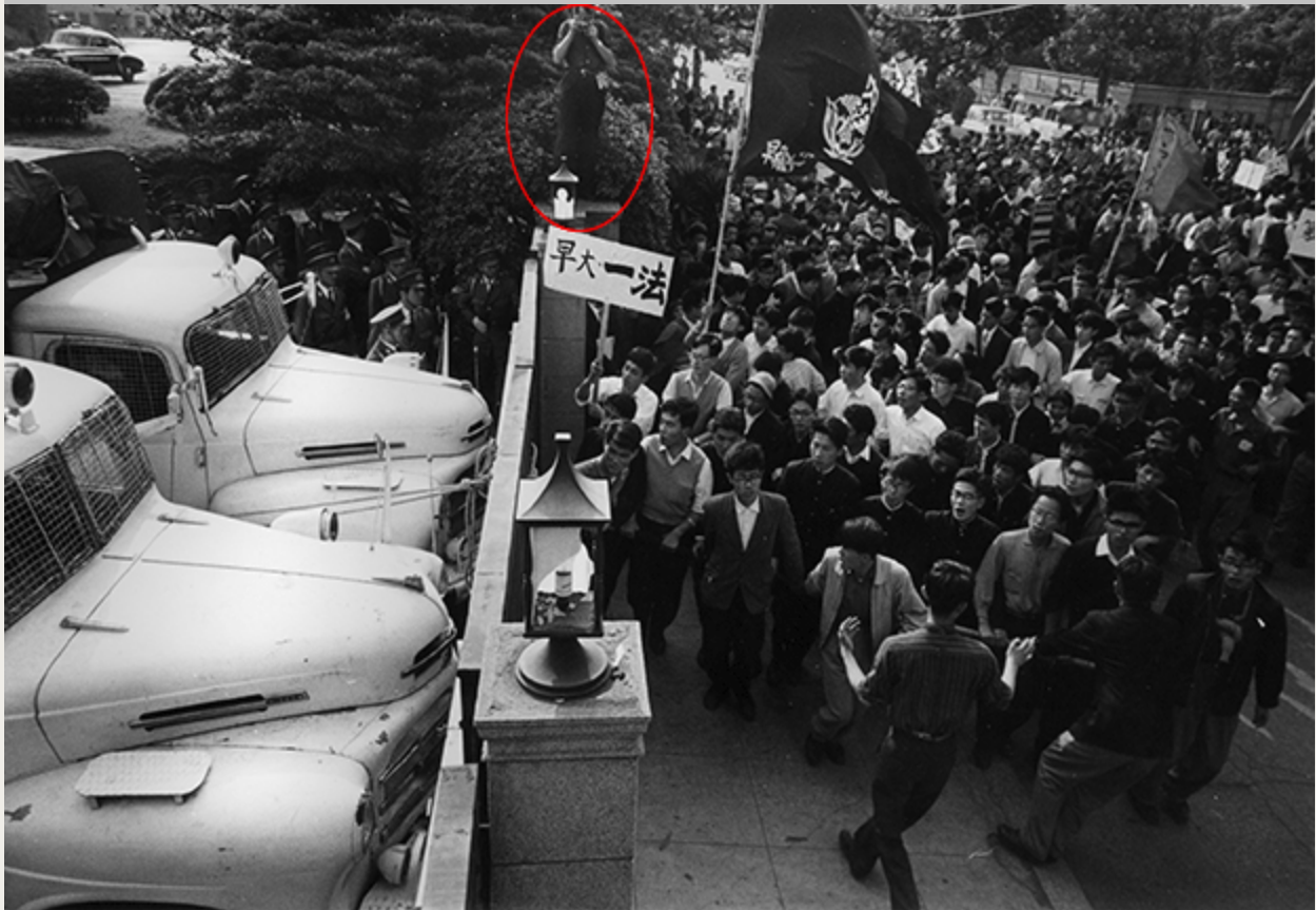
[anp7109] (with detail of a photographer highlighted)

A photographer standing on the wall as he records the scene mirrors Hamaya's own angle of vision—a “looking down from above” perspective that characterizes many of his depictions of the demonstrations.