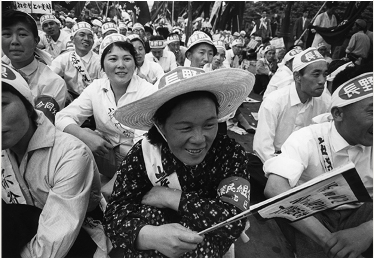
A farmer, part of a group from Nagano Prefecture, participates in a protest in front of the American embassy on June 11, 1960.