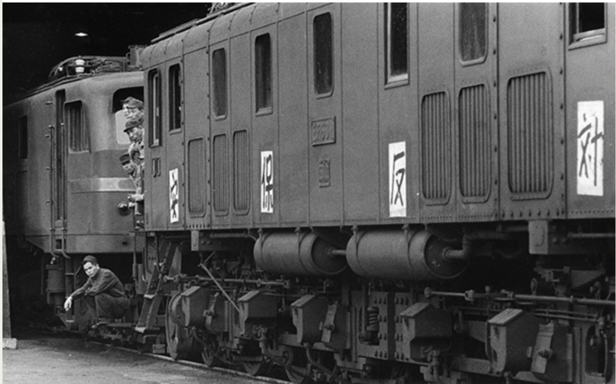
June 22, 1960. Striking rail workers sit on an idle train in a yard in Tokyo. The signs attached to the side of the car read “Against Anpo,” one of the most common slogans of the protest. The general strike on June 22 was the third strike that month. It involved 6.2 million workers and shut down the trunk line running from Tokyo to Osaka for the first time in history.