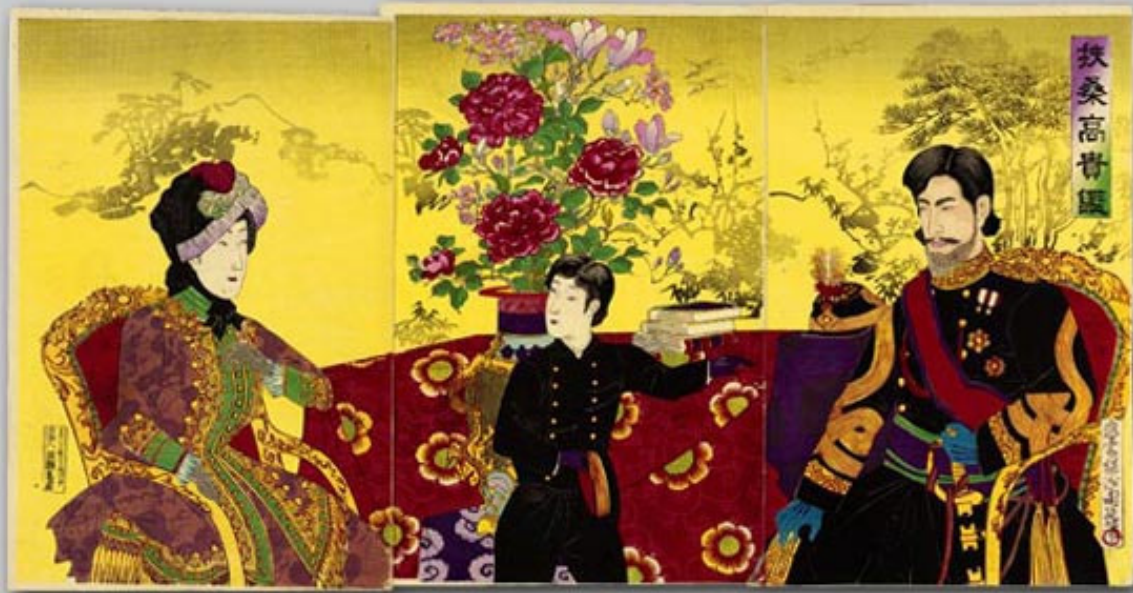
The Meiji emperor and empress with their young son. “A Mirror of Japanese Nobility” by Toyohara Chikanobu, August 1887

[2000.548] Sharf Collection, Museum of Fine Arts, Boston