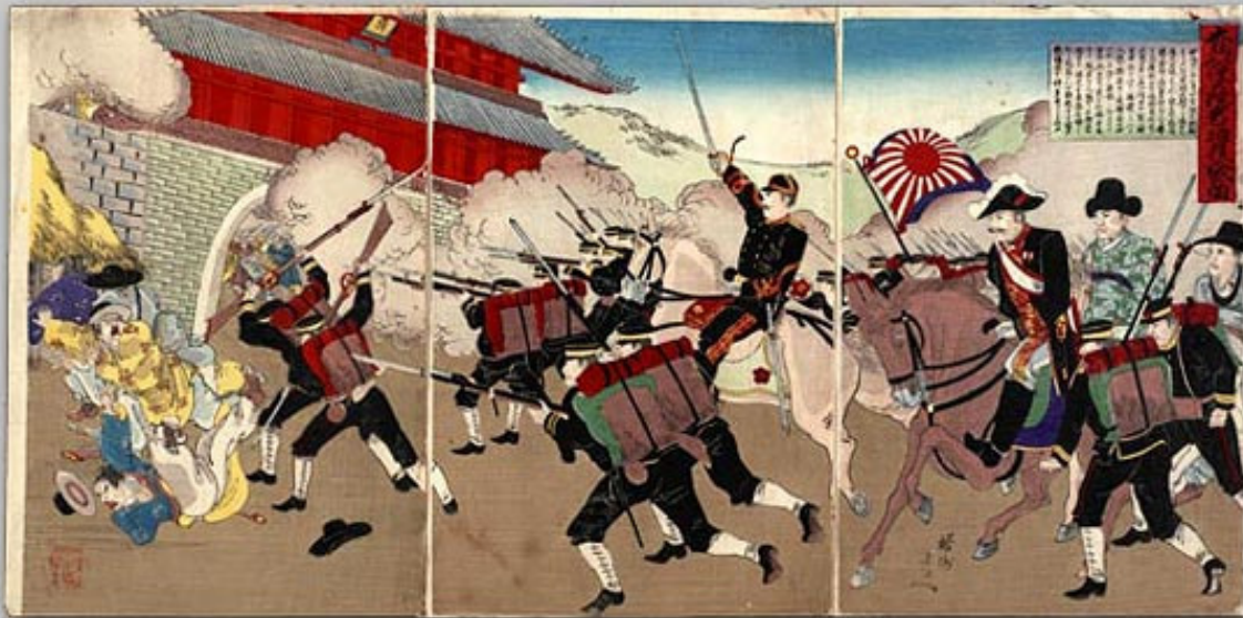
“Minister Ōtori Escorting the Korean Regent as They Enter the Palace at Keijo” by Toyohara Chikanobu, 1894 (with detail)

A number of Sino-Japanese War prints, such as this one, depicted Korean dignitaries in the company of the Japanese. This served the purpose of reinforcing the Japanese argument that they were fighting to protect Korea against Chinese encroachment and had the support of more progressive Korean leaders in doing so.