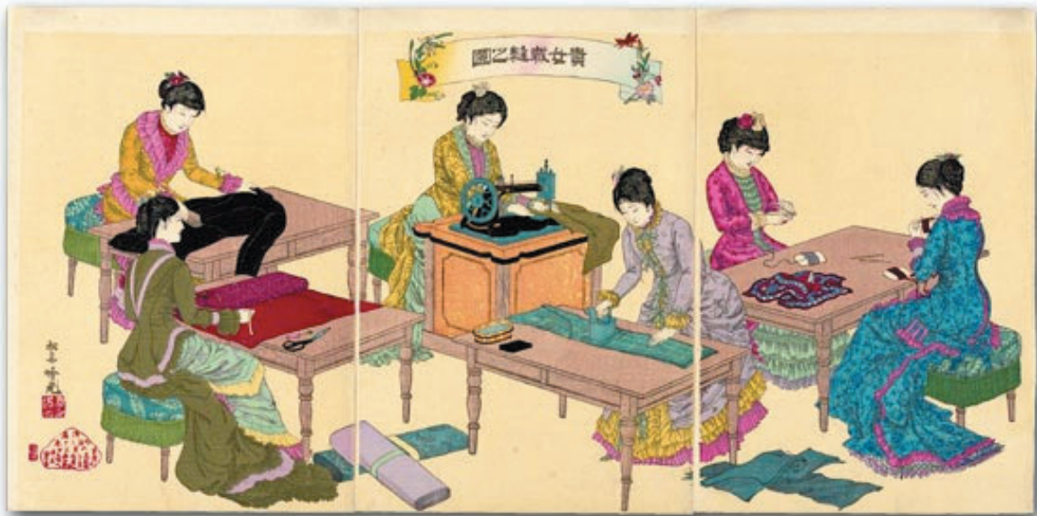
“Illustration of Ladies Sewing” by Adachi Ginkō, 1887

[11.18172.74] Museum of Fine Arts, Boston