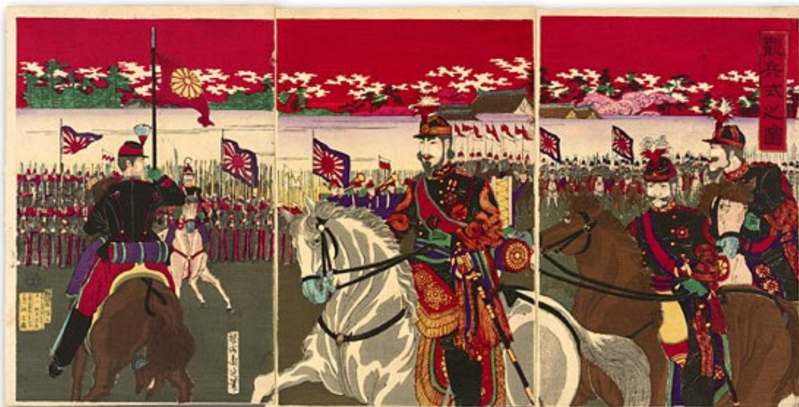
“Illustration of a Military Review” by Toyohara Chikanobu, 1887

The “brocade pictures” depicting the emperor that flourished in the 1880s and 1890s reflected this carefully cultivated new nationalism. Even when depicted engaged in familial or recreational or civilian activities, the emperor was almost invariably dressed in military uniform and plastered like a bulletin board with sashes and medals. At the same time, even when war still lay years in the future, he was frequently portrayed as the great supreme commander overseeing military maneuvers.