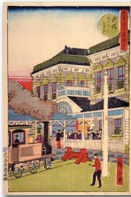
"Shimbashi Station" by Hiroshige III, 1874

Telegraph wires began to appear around the same time, along with outdoor street lamps (another of Perry's impressive gifts had been a telegraph apparatus with a mile of wire). Heavy stone and brick Western-style architecture soon became a familiar sight in the Tokyo-Yokohama area.