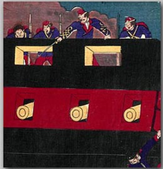
detail depicting French attackers

“Story from the Sino-French War” by Utagawa Kunisada III, 1884