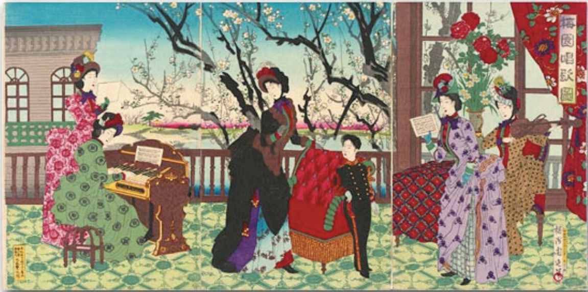
“Illustration of Singing by the Plum Garden” by Toyohara Chikanobu, 1887