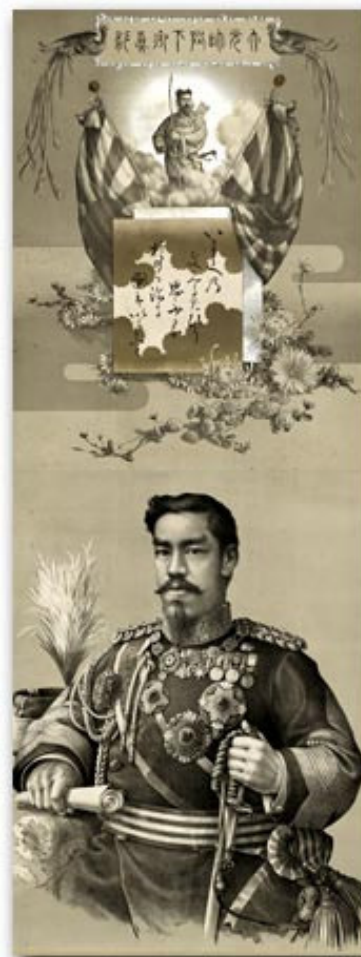
“True Portrait of His Majesty,” lithograph based on a drawing by Edoardo Chiossone, ca. 1889

When, in 1884, China sent troops to Korea to quell a pro-Japanese domestic uprising, only fear that Japan was not yet militarily prepared for war persuaded the Meiji leaders to work out a negotiated solution with China. Ten years later, when renewed turmoil in Korea again raised the prospect of Chinese intervention, the Japanese were stronger and not amenable to another negotiated solution. War with China came when the Japanese poured thousands of troops into Korea—in the name, as the propagandists would have it, of protecting Korea against intrigues by China. Neither Korea nor China nor Japan nor Asia would ever be the same again.