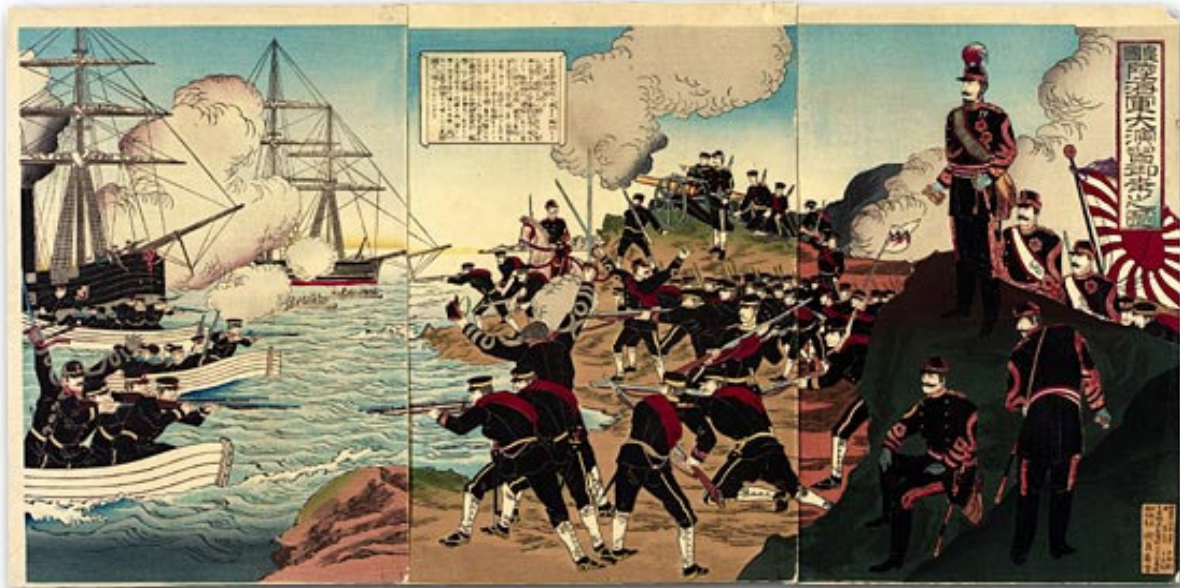
“Observance by His Imperial Majesty of the Military Maneuvers of Combined Army and Navy Forces” by Toyohara Chikanobu, 1890

[2000.499] Sharf Collection, Museum of Fine Arts, Boston