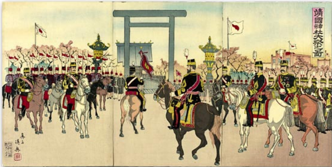
“Illustration of Grand Festival at Yasukuni Shrine” by Shinohara Kiyooki, 1895

[2000.513] Sharf Collection, Museum of Fine Arts, Boston