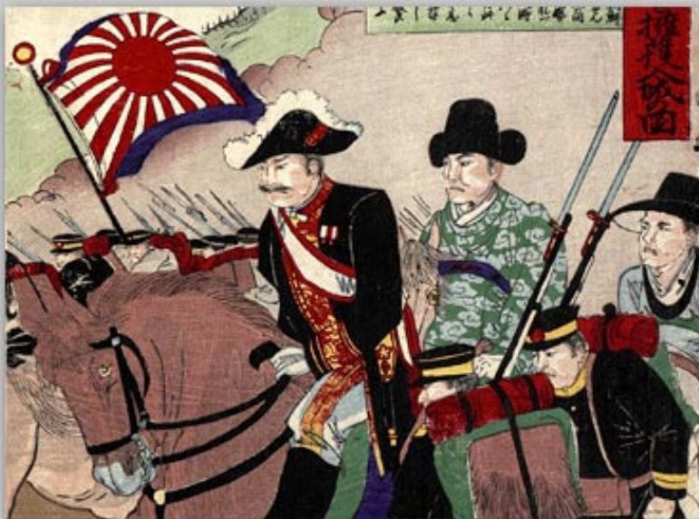
Detail of Japanese Minister Ōtori escorting the Korean king's father, who was appointed regent after the king was forced to abdicate.