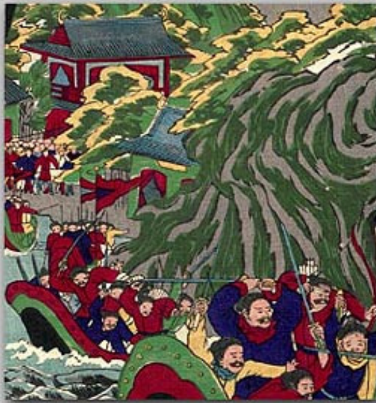
detail depicting Chinese forces