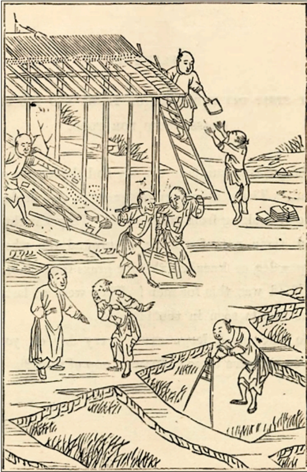
“They Sell Their Fields and Take Their Houses to Pieces”