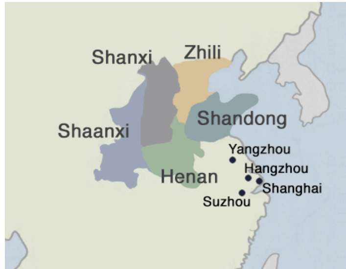
Provinces affected by the famine of 1876–1879

The North China Famine had local, national, and global implications. [2] It forced a series of hideous moral choices upon starving families in Shanxi Province, where the famine was most severe. Striking only a decade after the Qing government (1644 to 1911) finally suppressed three mid-century rebellions that had threatened to topple the dynasty, the famine also presented a serious crisis for an empire already beleaguered by foreign aggression, internal unrest, and fiscal woes.