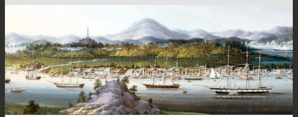
- please note that most images in this essay appear as details and can be enlarged for full view -

What we encounter in these visuals, in short, is the Canton trade system as portrayed largely through (and for) the eyes of the non-Chinese—colorful, romantic, sometimes exotic, often heroic, and exceedingly incomplete.