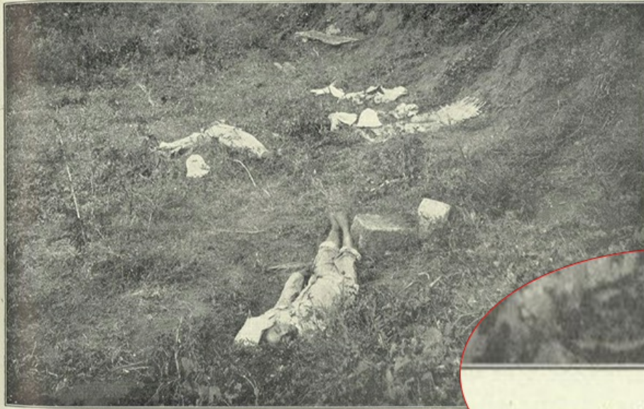
After the battle of February 5th raged around Manila in every direction every one with a camera took snapshots of the more impressive scenes. The above was taken at Singalon.