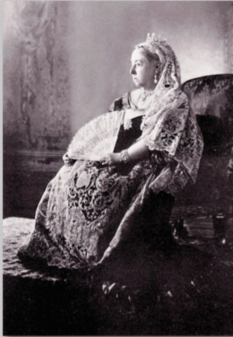
Queen Victoria as photographed for her Diamond Jubilee, 1897