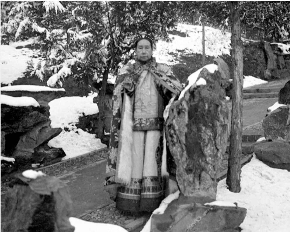
An informal portrait in the garden of Yiheyuan