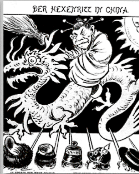
“Der Hexenritt in China” (The Witch’s Ride in China) Der Floh, 1900 (Germany)

caption “It is said in the way of Confucius about the rule of Tsu-tsie If over the waters of the Yang-Tse-Kiang The sun rises from Li-Hung-Chang, Two dragons will drive you out of the country well But a thousand devils come running.”