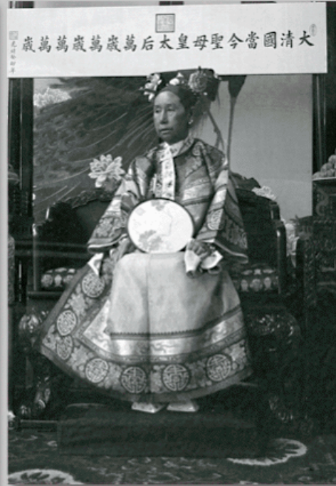
Cixi's 1903–04 portrait