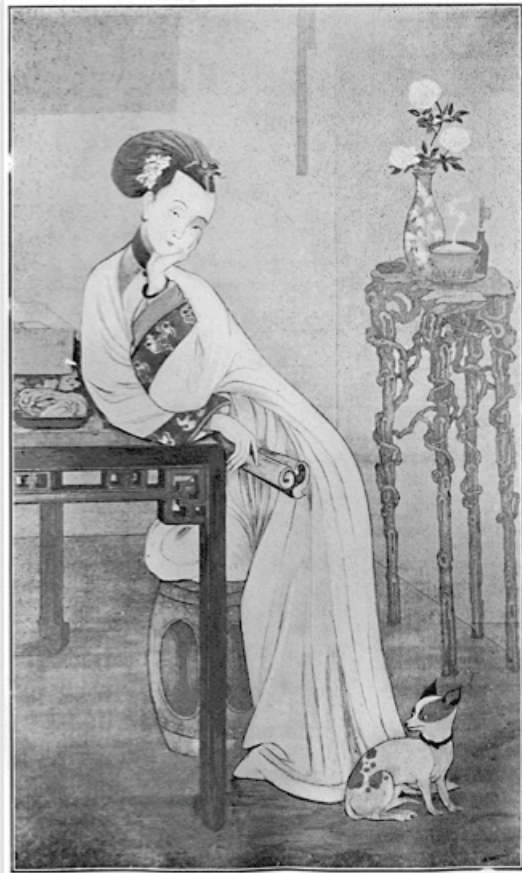
THE EMPRESS DOWAGER OF CHINA.

While Cixi's image abroad was largely that of a tyrannical "dragon lady," this romanticized portrait said to be a depiction of her as a young woman also circulated in publications such as Chinese Characteristics by Arthur Smith (1894, 1st edition).