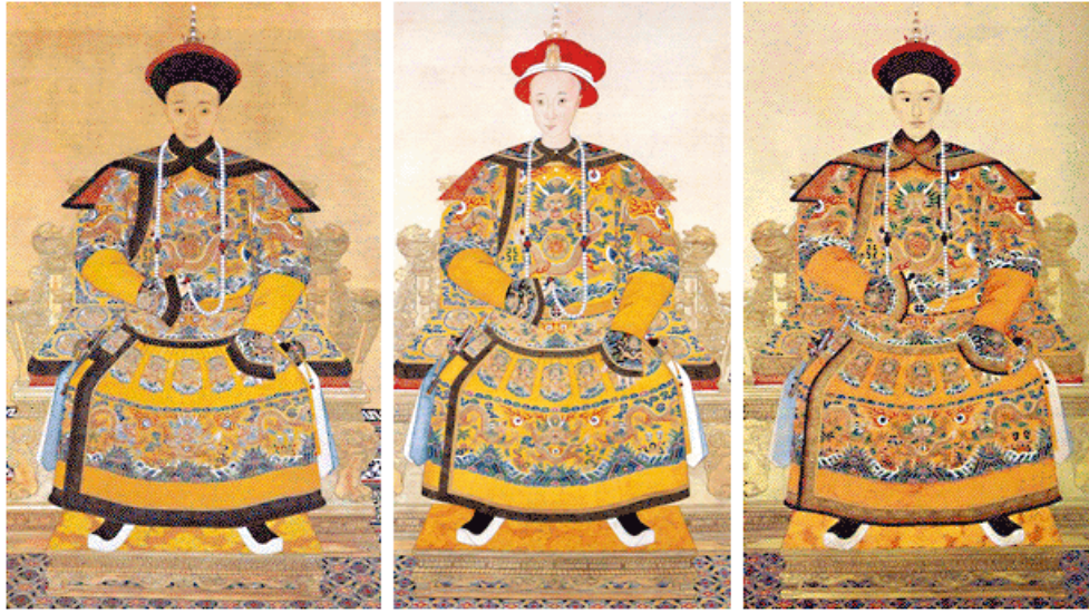
Traditional imperial portraits: Cixi and the three emperors with whom she was associated.