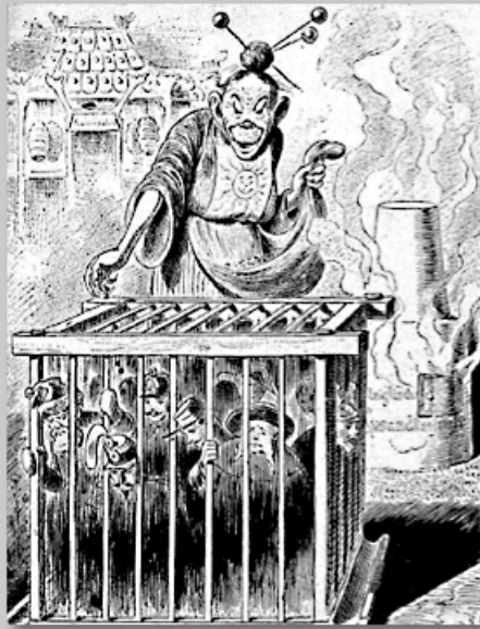
Kikeriki, No. 97 June 12, 1900 (Austria) caption "Cette bonne impératrice de Chine garde soigneusement dans le plus intime de son palais, les représentants des puissances. Alors! que signifie?" (This good empress of China carefully guards in the innermost part of the palace the representatives of the Powers. So! what does that mean?)