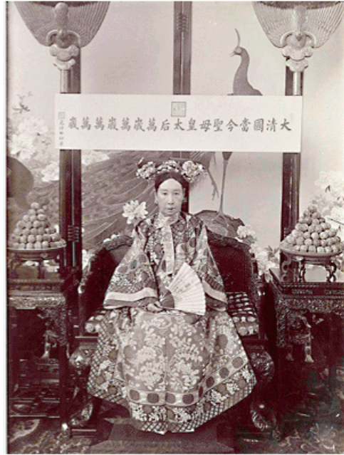
Cixi's official portrait for diplomatic visitors