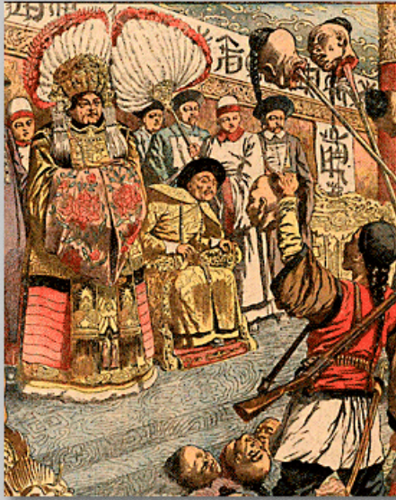
“Nouveaux Massacres en Chine” Le Petit Journal, March 6, 1904 (France) caption “L’Imperatrice douairiere presente a l’Empereur les tetes des mandarins accuses d’avoir favorise les interets russes.” (The Empress Dowager has presented to the Emperor the heads of mandarins accused of favoring Russian interests.)