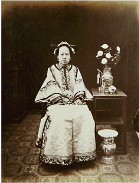
Traditional Chinese portrait