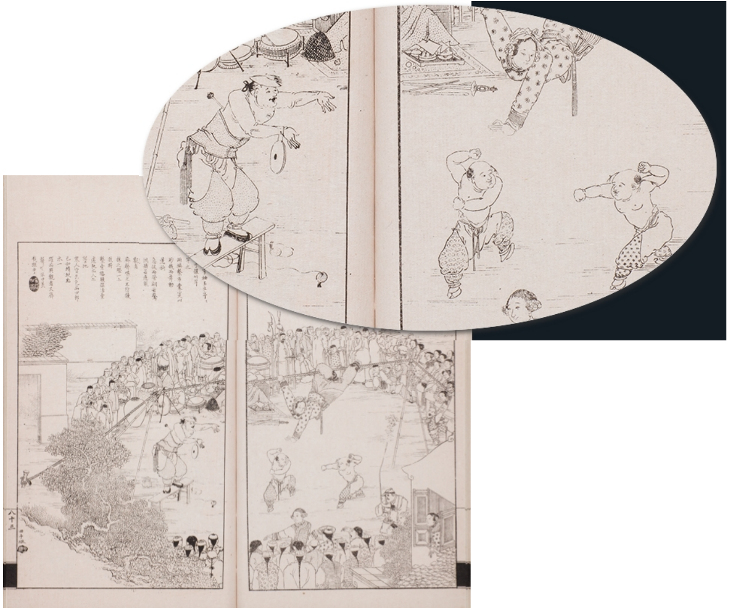
"Exhibition of Boxing and Acrobatics" with enlarged detail of "Boxer." From Dianshizhai huabao 35, GX 11 (1885), 2nd month.

In the poor districts of Shandong, very few men could afford enough education to obtain examination degrees, so the imperial culture of obedience to civil officials and respect for classical learning had little impact. Instead, the people of Shandong's periphery took pride in their military skills. Outlaws of the Marsh, a famous novel of the sixteenth century, widely read and retold by storytellers, had celebrated a band of martial arts fighters from southern Shandong. These strongmen fought tigers, engaged in drunken brawls, and like Robin Hoods defended local people from abuse by the wealthy. Martial arts teachers founded schools that taught young men special fighting techniques, and rival schools fought each other in competitions in the marketplaces. Other people could hire these toughs to help them out in local brawls. This image from a popular illustrated newspaper shows a crowd of people watching an exhibition of martial arts and gymnastics. The Boxers made their living by traveling around the countryside to perform before such audiences.