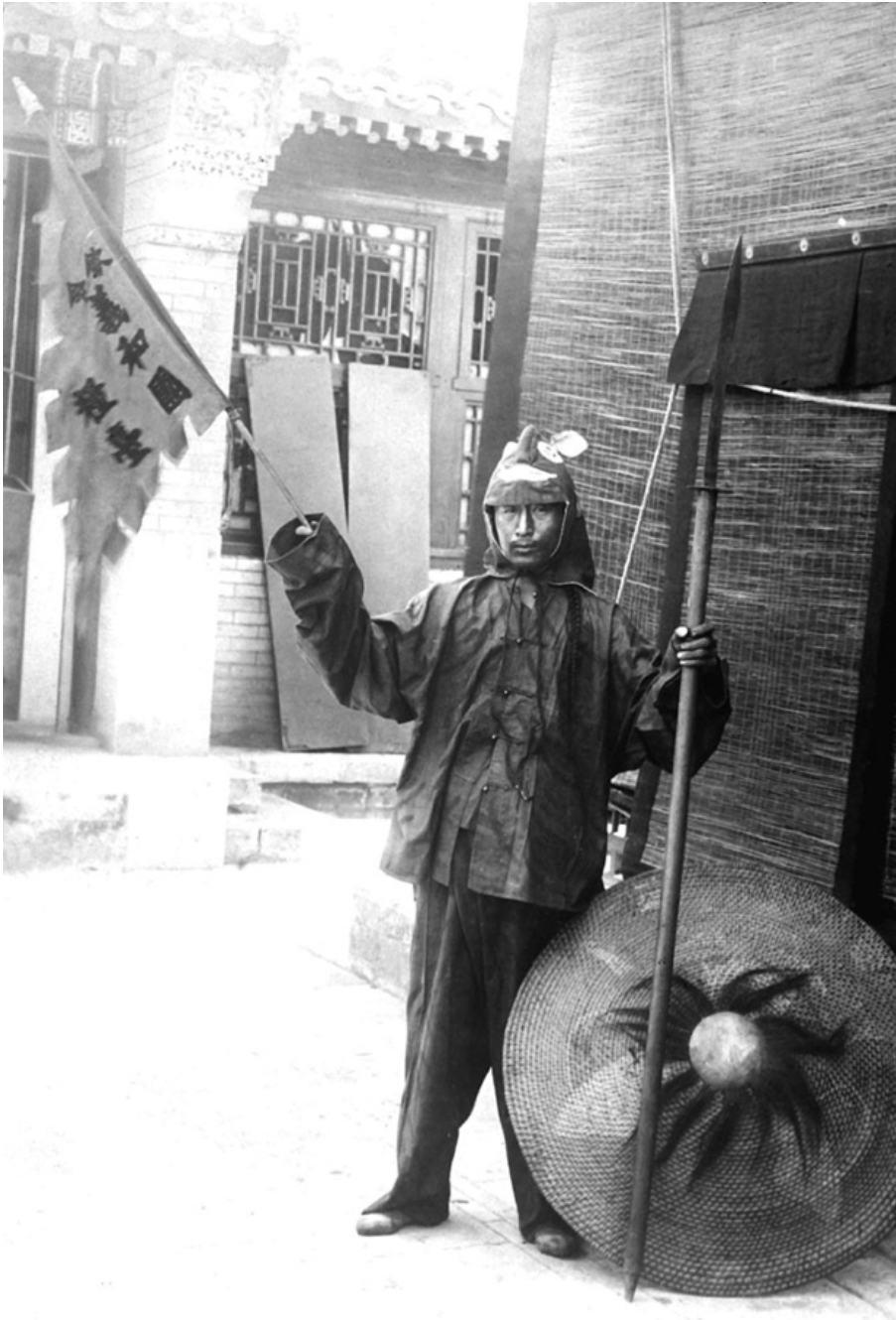
A widely circulated, clearly staged photograph of a Chinese "Boxer" with pike, shield, and a banner stating "Imperial Commissioned Righteous Militia," ca. 1900.

An obviously staged photograph of a "Boxer" (below) was widely distributed by foreign news agencies in 1900. This man represents one of the Boxer fighters who was recruited into the officially sponsored Qing militia. Despite the fact that most of the Boxers were poor peasants fighting in warm weather, the man is dressed in warm, newly issued clothing. He wears a distinctive hat, and waves a banner stating "Imperial Commissioned Righteous Militia." It is of interest for its presentation of martial equipment associated with the Boxers, such as the woven shield and heavy pole topped by a short blade.