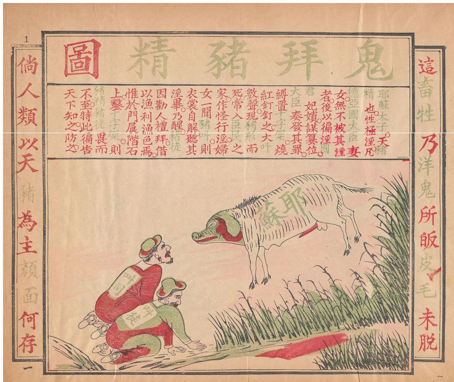
Caption (translation): "The Devils (foreigners) worshipping the Hog (Jesus)," from The Cause of the Riots in the Yangtse [Yangzi] Valley, published 1891 in Hankou.