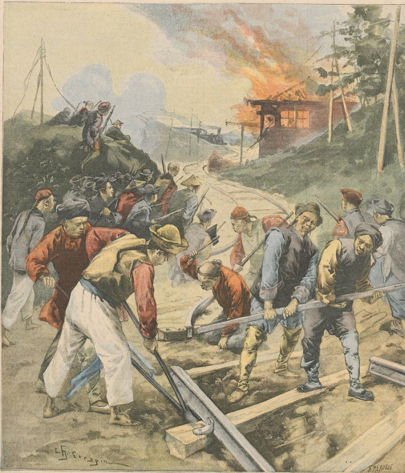
LES BOXEURS CHINOIS

TOUS LES JEUDIS SUPPLÉMENT LITTÉRAIRE 5 CENTIMES.