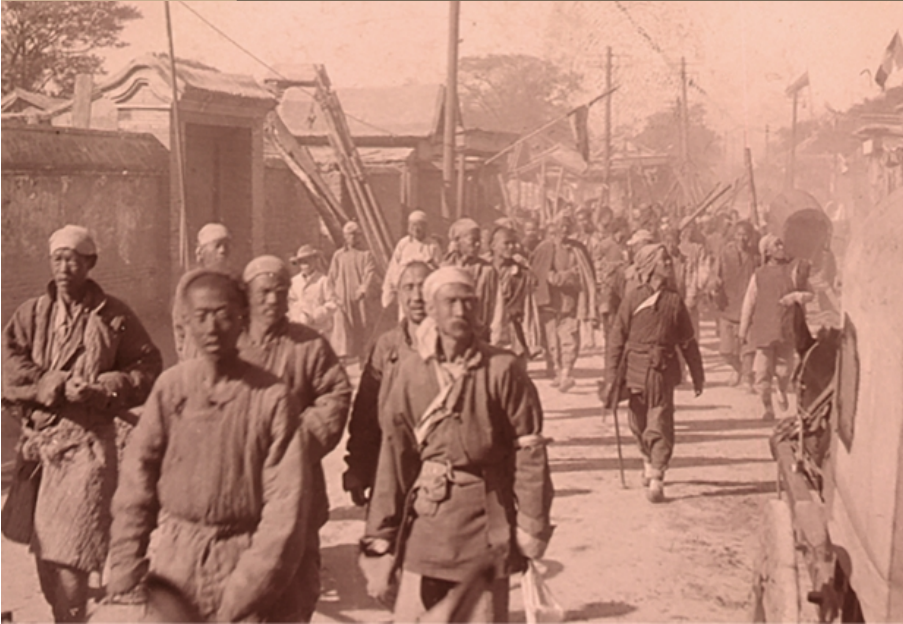
Detail from stereograph card with caption: "Company of Boxers, Tien-Tsin, China."

This is one of the few existing unstaged photographs of Boxers, other than depictions of them as prisoners.