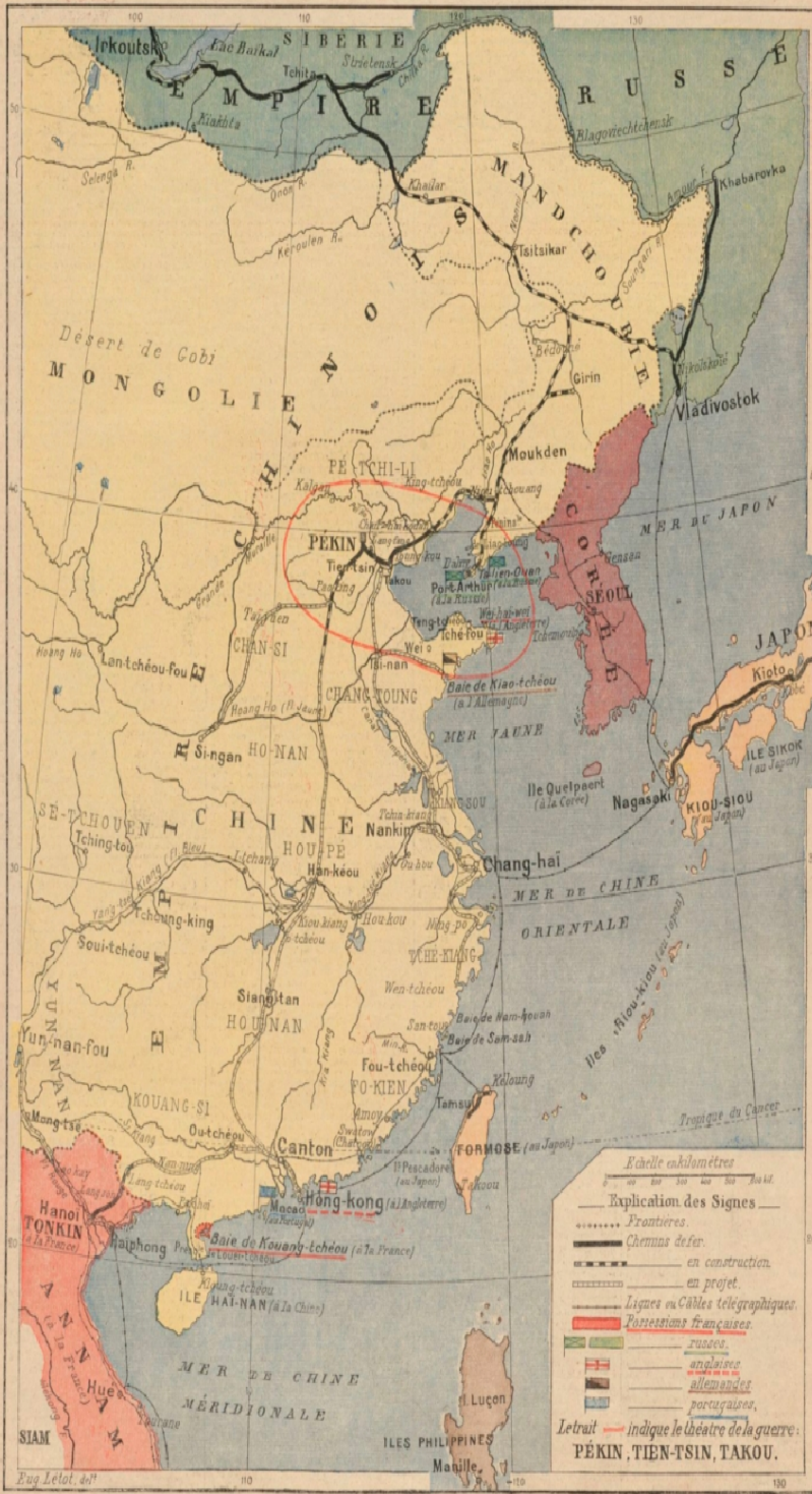
LES ÉVÉNEMENTS DE CHINE Carte du théâtre de la guerre

“Les Événements de Chine. Carte du Théâtre de la Guerre” Le Petit Journal Supplément Illustré, July 8, 1900