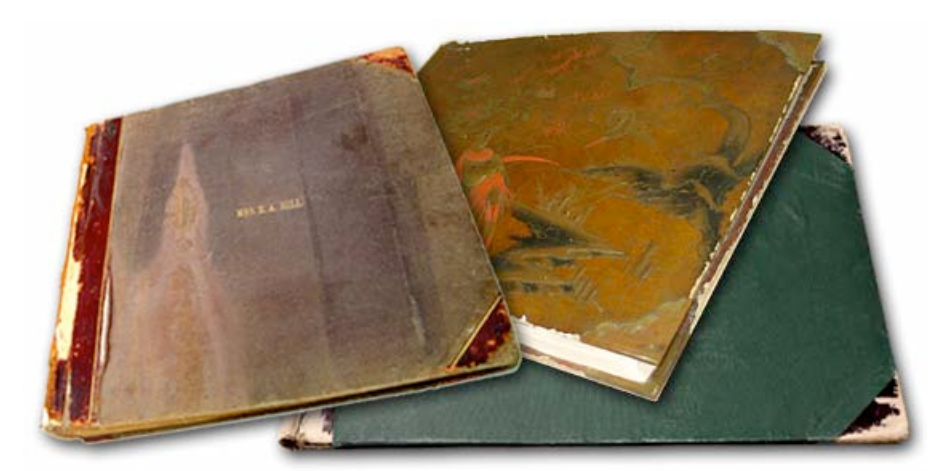
Covers from several commemorative albums: embossed fabric tourist's album (left); a lacquer cover with inlays (middle); the linen cover from the Beato album featured in this site (right). The lacquer album is the cover for another Beato "Views of Japan" album featuring landscapes and tourist sites, and can be viewed in a companion Visualizing Cultures unit: "Felice Beato's Japan: Places."

As the tourist market grew in the 19th century, photo collections became a way of commemorating the traveler's holiday. In these decades before personal cameras, tourists visited the commercial photographer's studio to plan their itinerary or compile a selection representative of what they saw or fancied.