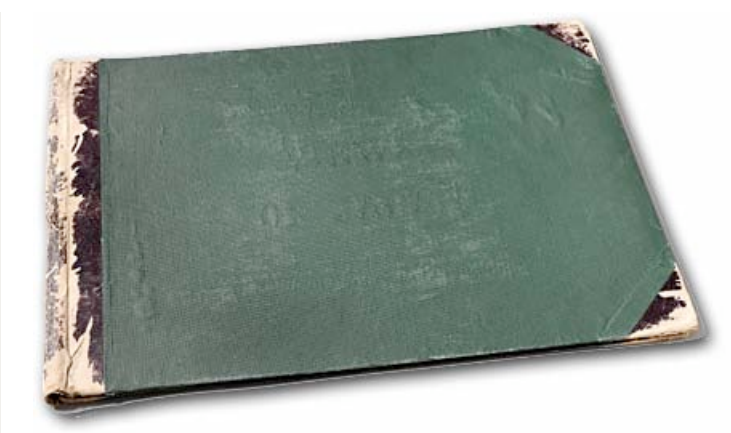
Beato's "Views of Japan" albums existed in multiple versions. The worn album cover pictured here is from the album Beato compiled shortly after 1868, held by the Smith College Museum of Art and used in creating this unit.