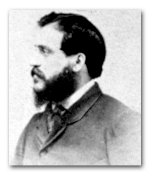
Portrait of Felice A. Beato, 1860s by an unknown photographer (detail). [bjs100]

Beato's life and work are of considerable interest to scholars, curators, and collectors. His album Photographic Views of Japan with Historical and Descriptive Notes , published around 1869, introduces a dialogue between the photograph and the descriptive essay.