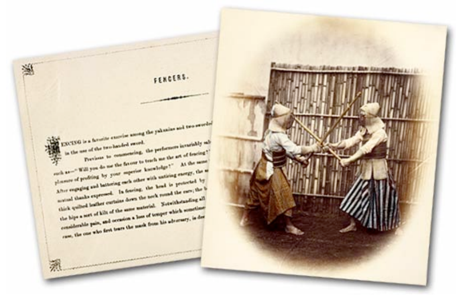
"Fencers" illustrates how each photograph in Beato's album is paired with an ornately laid-out, essay-style caption on the left-hand facing page.

These captions are of particular interest today not only for the stories they tell, but also for the odd and old-fashioned ways in which many Japanese names and words are "romanized." They also contain many factual errors that reveal the rudimentary level of foreign knowledge of Japan at this early stage in the nation's new relationship with the West. (The captions have been reproduced without correction here.)