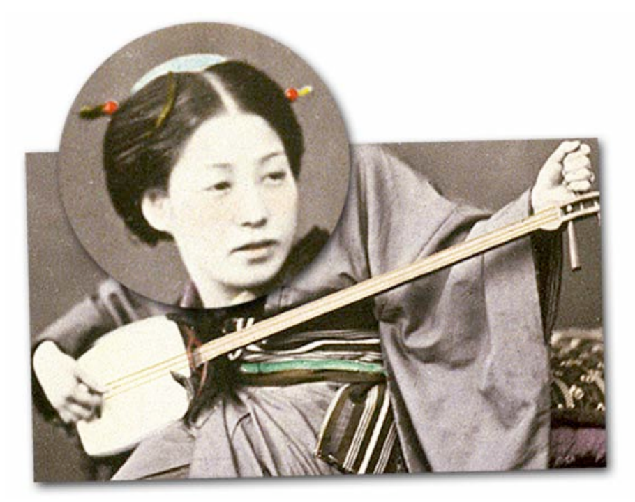
Details from "Girl Playing the Samisen" reveal how the manipulation of chemicals in the development process produced velvety shades of purple and brown in the clothing, while hand-applied watercolors were used to tint the hair ornaments, samisen strings, and sash. Such meticulous coloration gave a feeling of elegance and even luxury to black-and-white photos.