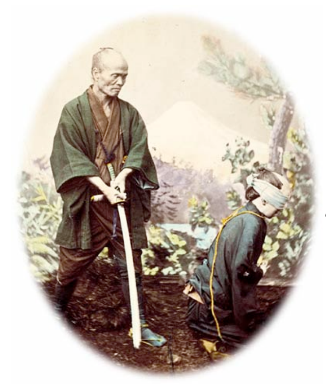
"The Executioner" (detail)

The album concludes with two Beato photographs of violence. The caption accompanying this photo suggests that it depicts an actual execution ground. It was, in fact, staged in Beato's studio.