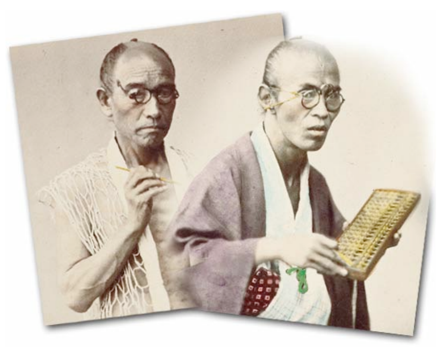
The models for "Our Painter" (left) and the merchant "Mr. Shōjirō" bear remarkable physical resemblance (could it be the same model?)—but the long accompanying captions single them out as very different personality types.

The "Views of Japan" reproduced in this unit represent portraits selected from Beato's wide-ranging opus and sold as a group by the photographer. This particular album, held by the Smith College Museum of Art, contains 50 images formerly bound in a green linen cover with the printed title, now absent, in the center of the cover. Although each photograph is different, the viewer may discern certain resemblances in the physical characteristics of the sitters. Beato usually hired his sitters and dressed them in appropriate attire for his studio photographs. The models for "Mr. Shōjirō" and "Our Painter" could almost be the same person, for example, although their descriptions differ greatly. In both images, the model holds instruments of trade in his hands. Mr. Shōjirō holds "that ingenious little calculating table of his ...," the soroban, or abacus. The painter stands in front of his portfolio of prints while holding his palette and brush. "A bit of a roué is our painter," Murray states, "much given to wine, and not insensible to the charms of singing girls. A good creature on the whole...."