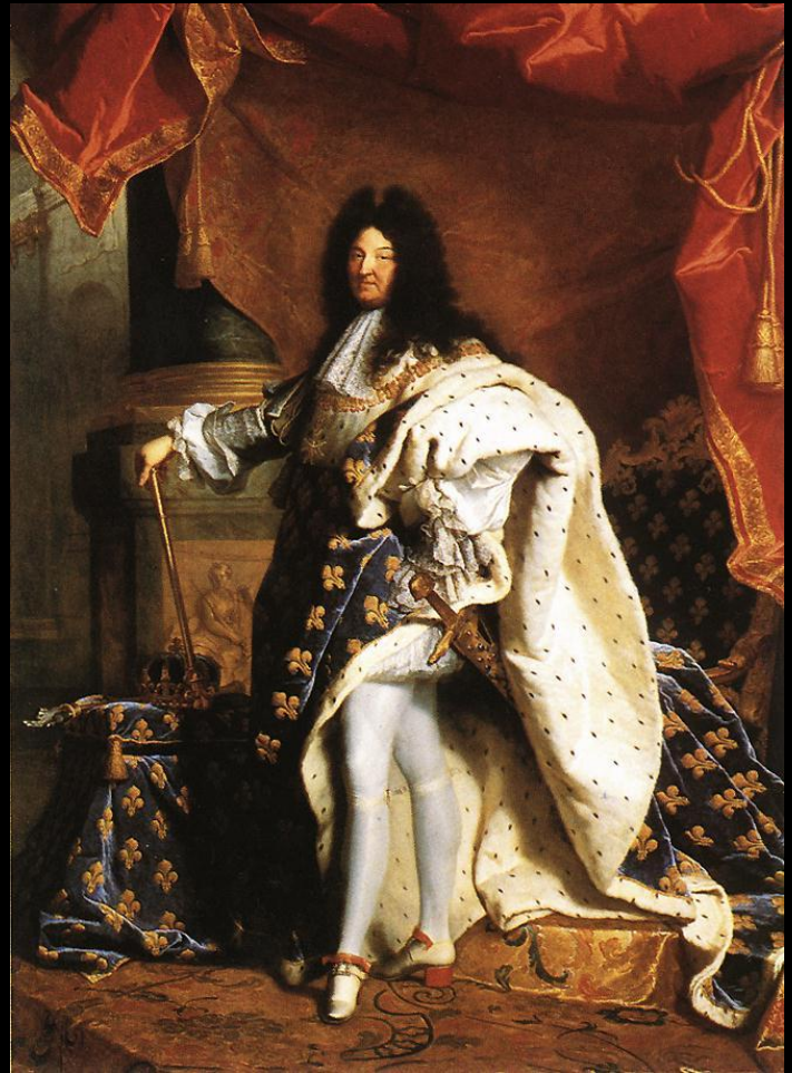
Portrait of Louis XIV, Hyacinth Rigaud, 1701