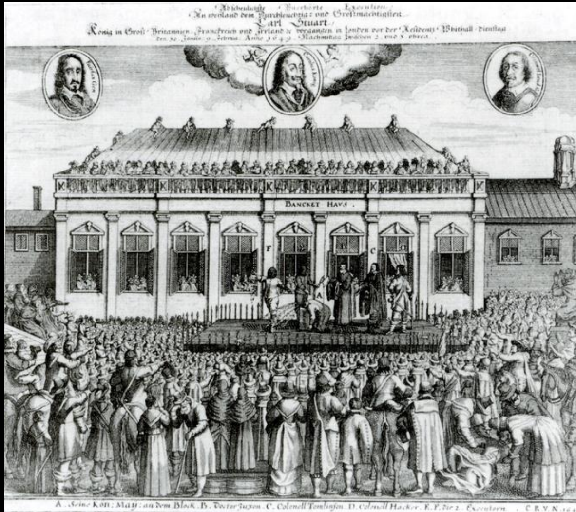
Contemporary German Engraving of the Execution