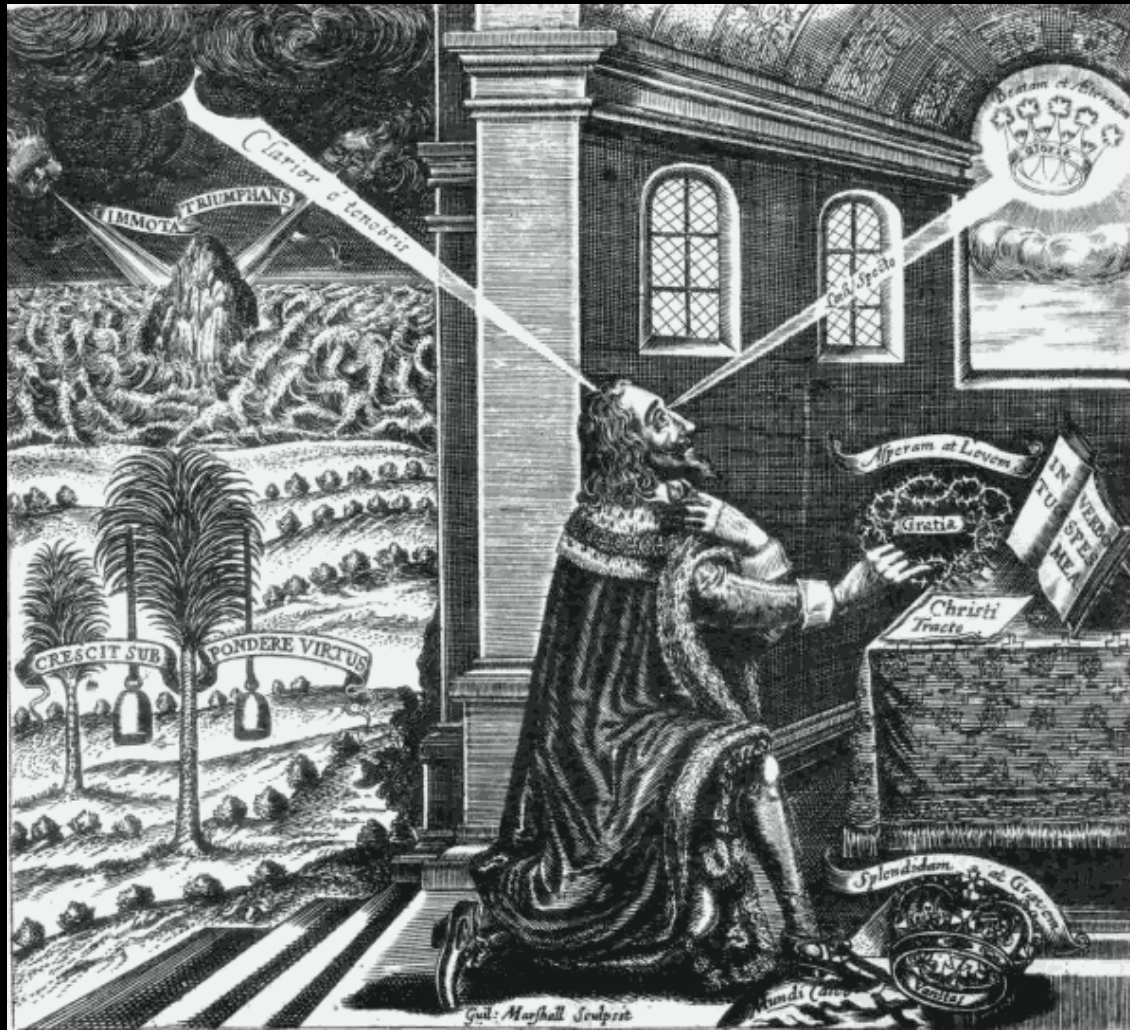
Frontispiece to Eikon Basilike ( The Royal Portrait ), 1649