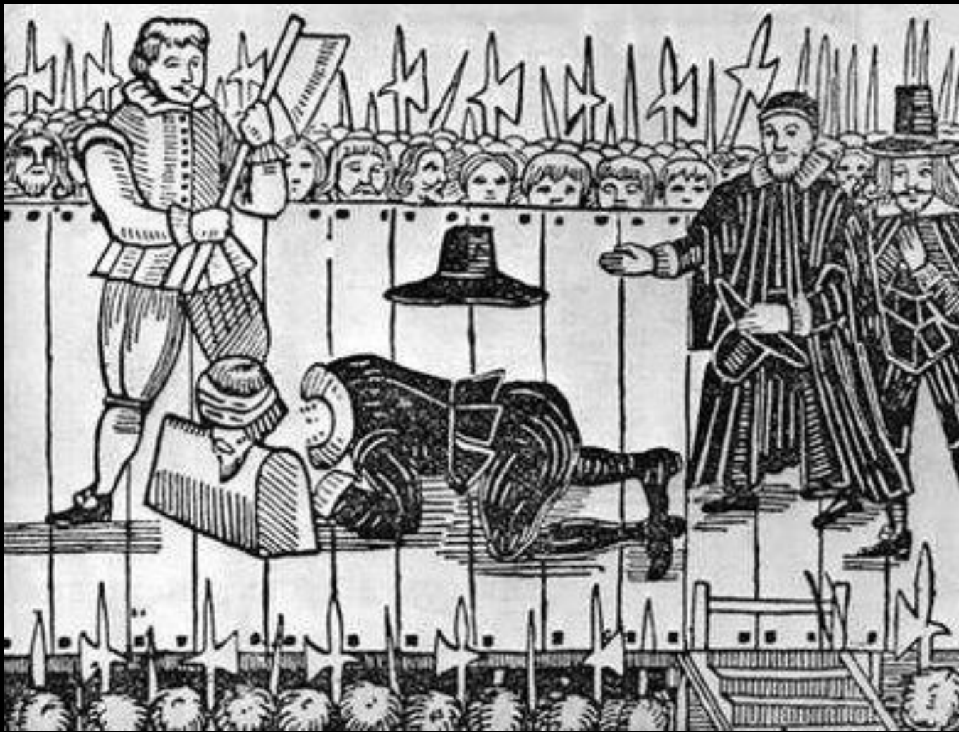
English Woodcut Engraving of the Execution