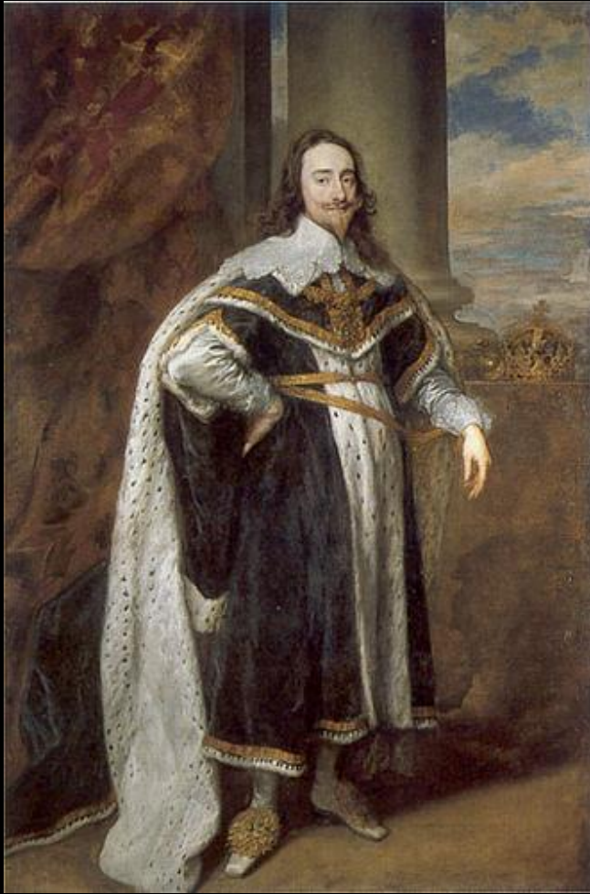
Portrait of Charles I, Anton van Dyck, 1636