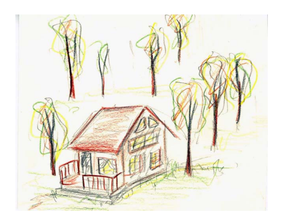
4.500 Designing a Cabin

Efficiency in design and form will make the small cabin of 400 sq. ft. plenty big enough for its function. While creating a cozy atmosphere through intimate spaces, a façade of large windows facing the river bank will open the main living room up to the outdoors. These windows, along with sliding panels that enter and exit onto a side porch will increase ease of access and connection to nature, and encourage the tenant to make mental or physical explorations of the river site. A unique and interesting interior that promotes creative inspiration will give hints of modern architecture but be balanced by traditional elements, such as the furniture and building materials. This sense of timelessness given to the building will enhance the tranquility of a peaceful river getaway and let the artist feel a closer connection to the historical value of the area.